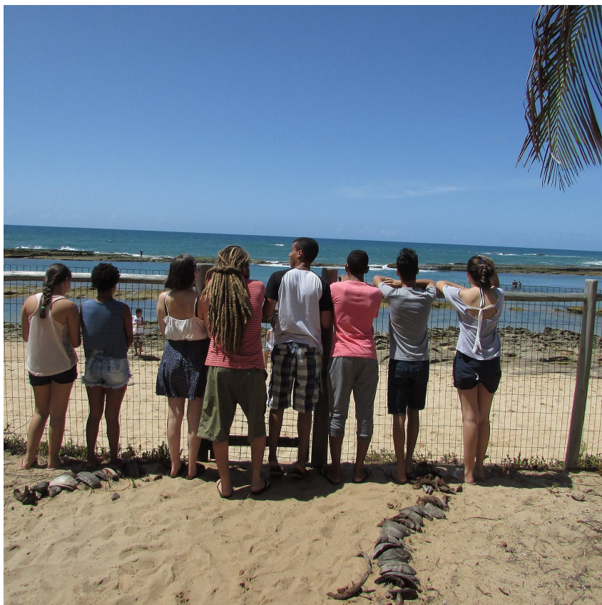
Photo taken during our integration day at Piruí beach in Arembepe